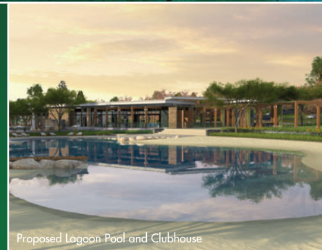
Proposed Lagoon Pool and Clubhouse

Our Sales & Information Centre, located at the estate's entrance is open Monday to Sunday 10am – 5pm. Visit one of our consultants or call 010 500 0405.