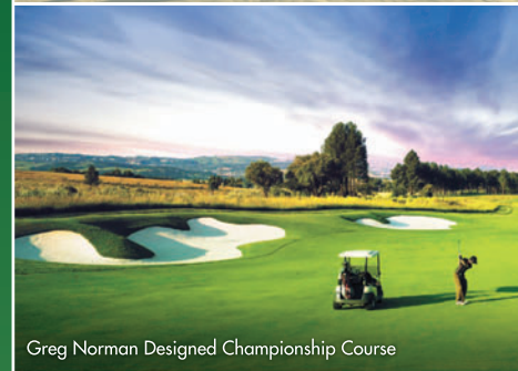
Greg Norman Designed Championship Course