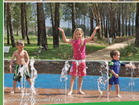
Community Focused Parks